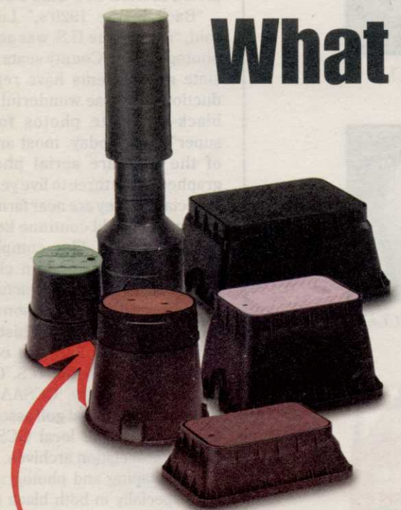
New 3" extension for 10" round boxes

For specifications on the complete line of valve boxes, and the location of your nearest dealer, contact AMETEK, Plymouth Products Division, 502 Indiana Avenue, Sheboygan, WI 53081. Tel: 800-222-7558, Ext. 388 for literature, Ext. 321 for distributors. (In WI, 414-457-9435). Fax: 414-457-6652. www.ametekwater.com