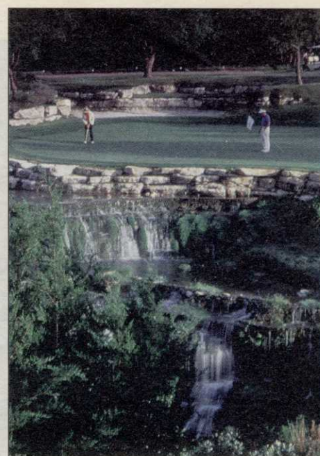
The Fazio Course at Barton Creek Golf and Conference Center in Austin, Texas, has already converted to a stress-tolerant super-dwarf Bermudagrass.

FOR A SPECIAL SECTION ON SUMMER STRESS, "BEATING THE HEAT," TURN TO PAGES 30-34.