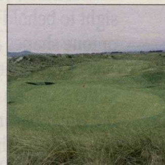
Gary Player (at left) has added facility management to his design and club-making ventures. Above: The New Course at Portmarnock near Dublin, Ireland — one of a growing roster of courses managed by the European PGA Tour. For stories, see pages 43-46.