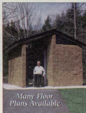
Many Floor Plans Available