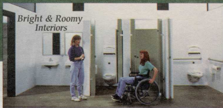
Bright & Roomy Interiors