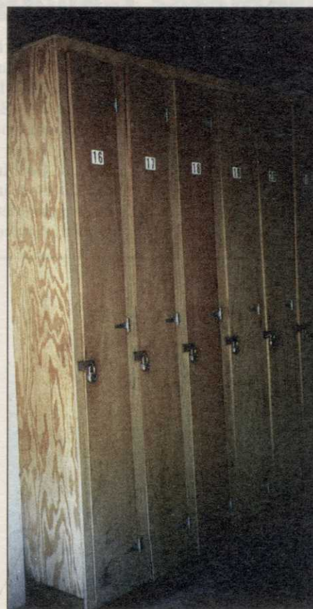
The outside lockers at Olde Florida Golf Club.