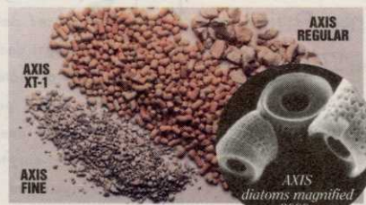
AXIS has internal pores designed by nature to absorb and release water.

AXIS is the only American-made calcined DE soil amendment. It's naturally porous with low