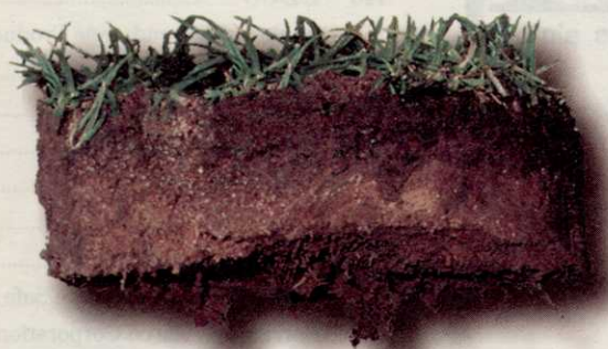
Poor soil structure results in recurrent drainage and disease problems, excessive irrigation and syringing needs, and unnecessary maintenance expense.

The national mail panel survey of 30,000 households was conducted for the NGF by Market Facts Inc. of Chicago, a major market research firm.