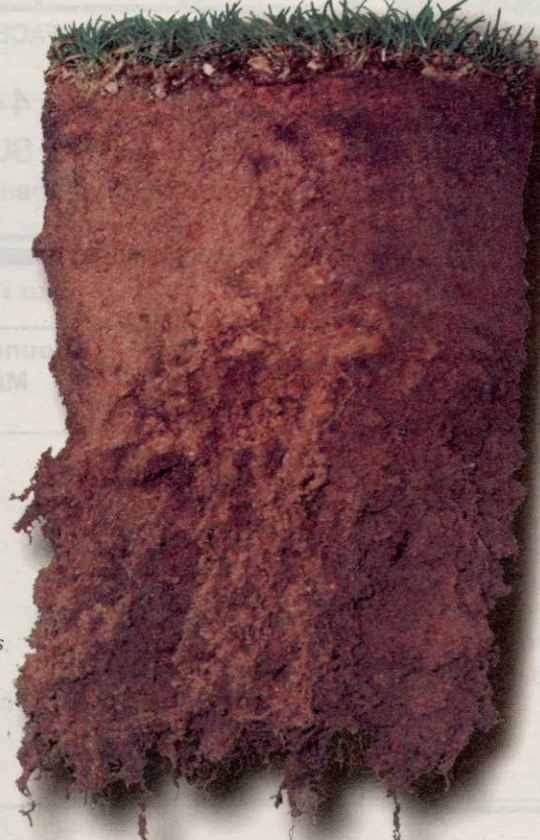
University and field tests show AXIS improves infiltration, increases available water, reduces compaction, and improves soil structure to promote healthy root growth.