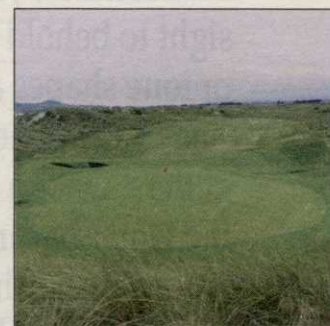
Gary Player (at left) has added facility management to his design and club-making ventures. Above: The New Course at Portmarnock near Dublin, Ireland — one of a growing roster of courses managed by the European PGA Tour. For stories, see pages 43-46.