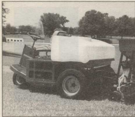
LIS' new SGI injection system