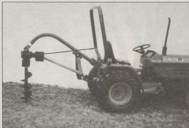
Worksaver's 300 is compatible with most compact/utility tractors.