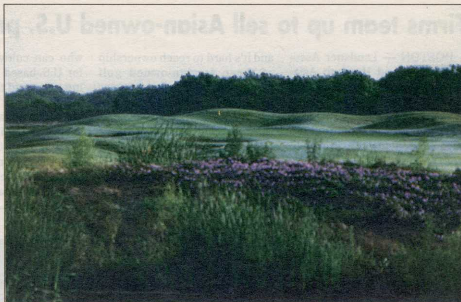
Rio Colorado GC in Bay City, Texas, is one of Golf Services Group's courses.