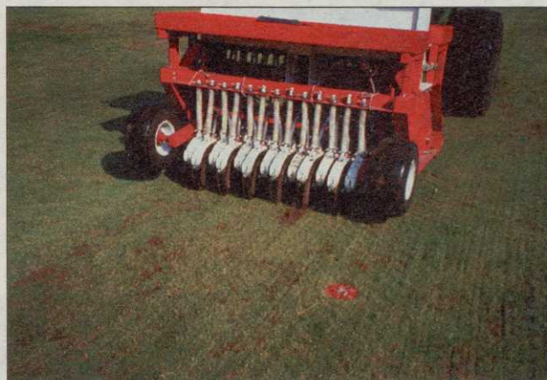
Equipment to apply pesticides below the soil surface has been developed and has shown modest success in enhancing mole cricket control.