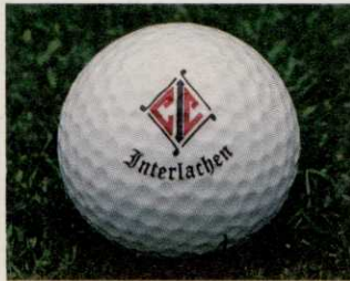
Interlachen Country Club Edina, MN