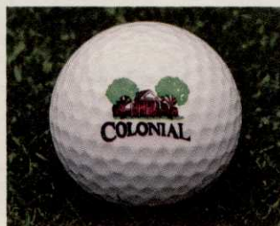
Colonial Country Club Fort Worth, TX