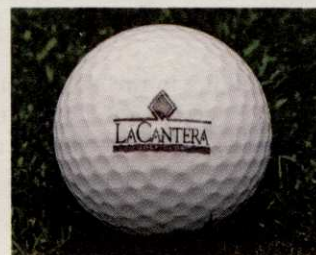
La Cantera Golf Club San Antonio, TX