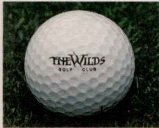
The Wilds Golf Club Prior Lake, MN