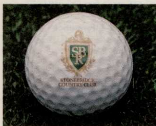
Stonebridge Country Club McKinney, TX