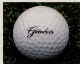
The Greenbrier White Sulphur Springs, WV