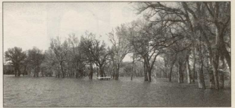
Grand Fork, N.D.'s Lincoln Park GC, where all 18 holes were flooded.