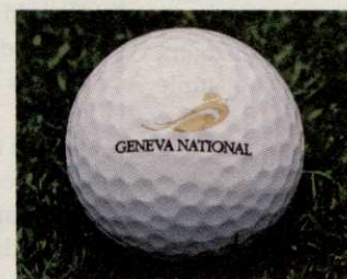
Geneva National Golf Club Lake Geneva, WI

Which gives crews more opportunity to rebuild sand traps, tend to flower beds, and do all the other things that make good courses great. And great courses even greater.