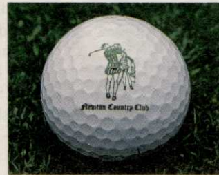
Newton Country Club Newton, NJ