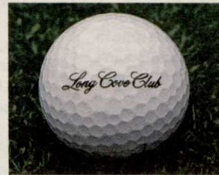
Long Cove Club Hilton Head Island, SC