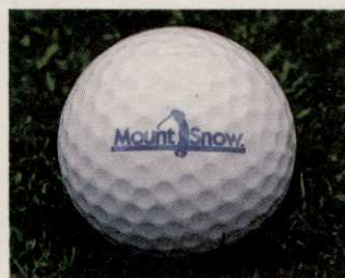
Mount Snow Golf Course West Dover, VT