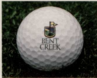
Bent Creek Country Club Lancaster, PA