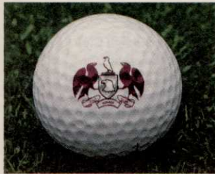
Monroe Golf Club Pittsford, NY