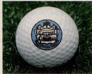
Carmel Country Club Charlotte, NC