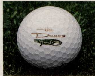
The Dunes Golf & Beach Club Myrtle Beach, SC