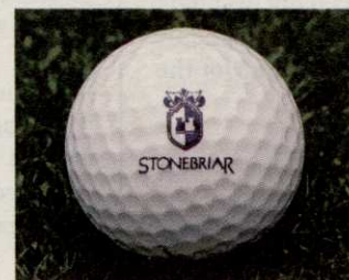
Stonebriar Country Club Frisco, TX