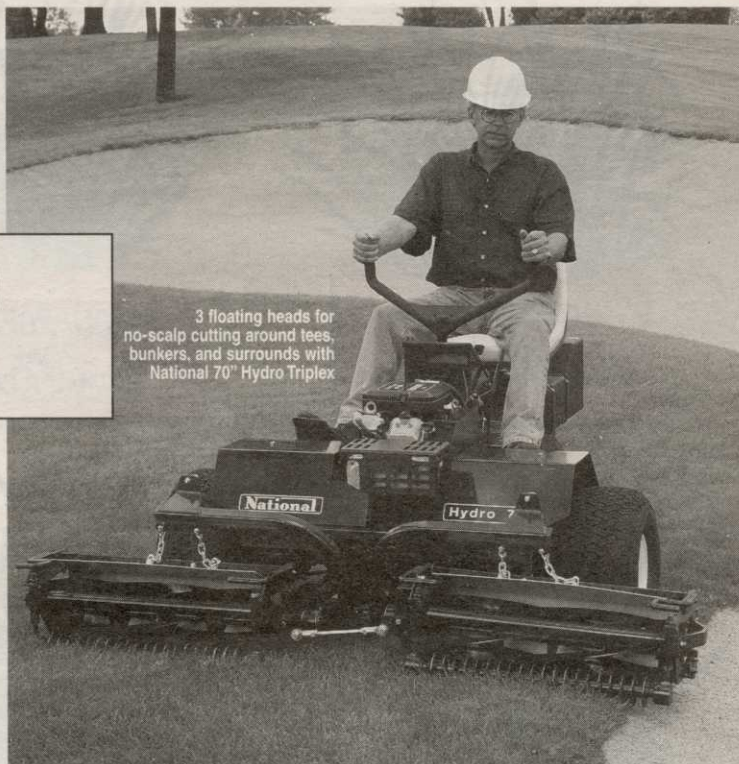
3 floating heads for no-scalp cutting around tees, bunkers, and surrounds with National 70" Hydro Triplex

700 Raymond Avenue St. Paul, Minnesota 55114 TEL (612) 646-4079 FAX (612) 646-2887