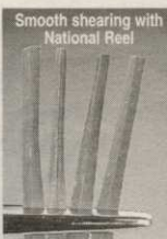
Smooth shearing with National Reel