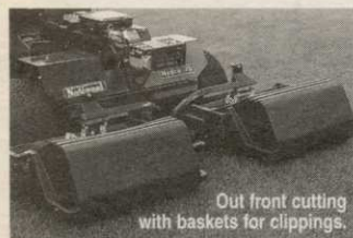
Out front cutting with baskets for clippings.