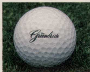
The Greenbrier White Sulphur Springs, WV