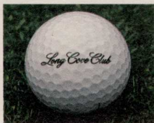
Long Cove Club Hilton Head Island, SC