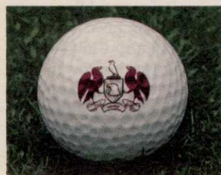
Monroe Golf Club Pittsford, NY