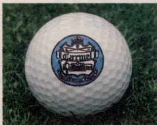
Carmel Country Club Charlotte, NC