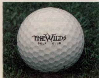
The Wilds Golf Club Prior Lake, MN

When completed, the team will transform the 176 acres into a routing that will maintain the natural woodlands, lakes and wetlands, with elevation changes of up to 60 feet.