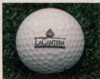
La Cantera Golf Club San Antonio, TX