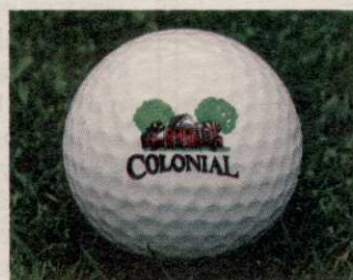
Colonial Country Club Fort Worth, TX