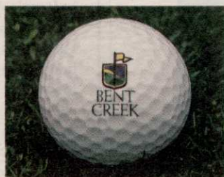
Bent Creek Country Club Lancaster, PA