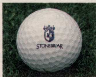
Stonebriar Country Club Frisco, TX