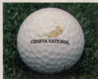
Geneva National Golf Club Lake Geneva, WI

Which gives crews more opportunity to rebuild sand traps, tend to flower beds, and do all the other things that make good courses great. And great courses even greater.