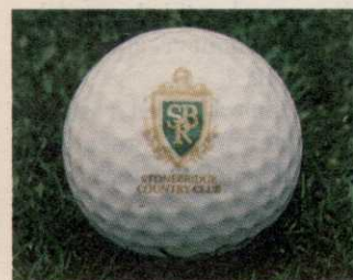
Stonebridge Country Club McKinney, TX