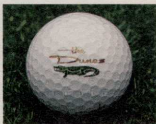
The Dunes Golf & Beach Club Myrtle Beach, SC