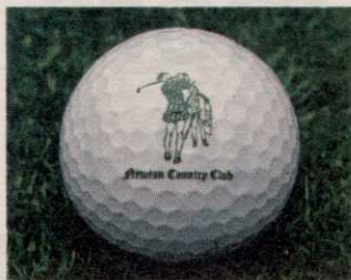
Newton Country Club Newton, NJ