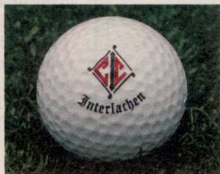
Interlachen Country Club Edina, MN