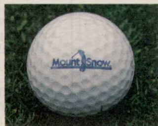
Mount Snow Golf Course West Dover, VT