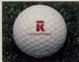
Keystone Ranch Golf Course Keystone Resort, CO