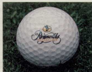
Reynolds Plantation Greensboro, GA