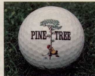
Pine Tree Golf Club Boynton Beach, FL