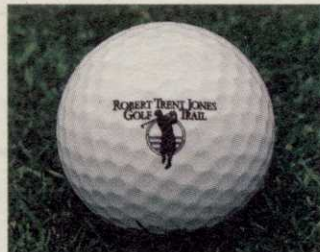
Grand National Auburn/Opelika, AL

That chore has been the job of Total Golf Construction, the golf course contractor from Vero Beach, Florida.