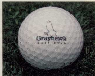
Grayhawk Golf Club Scottsdale, AZ