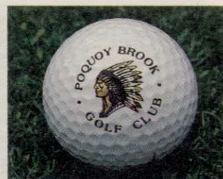
Poquoy Brook Golf Club Lakeville, MA