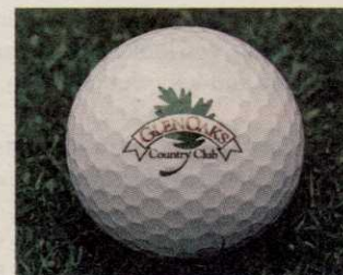
Glen Oaks Country Club West Des Moines, IA