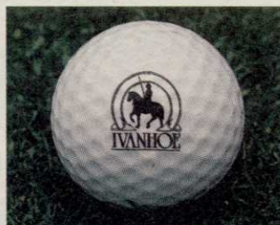
Ivanhoe Club Ivanhoe, IL