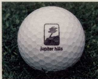
Jupiter Hills Club Jupiter, FL