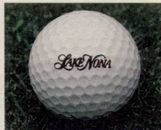
Lake Nona Club Orlando, FL