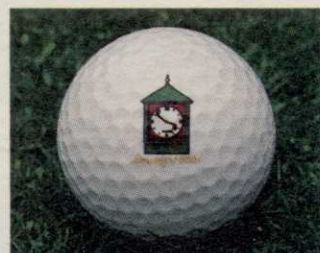
Lassing Pointe Golf Course Union, KY