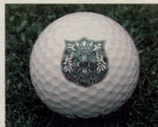
Bryn Mawr Country Club Lincolnwood, IL