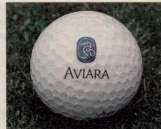
Four Seasons Resort Aviara Carlsbad, CA