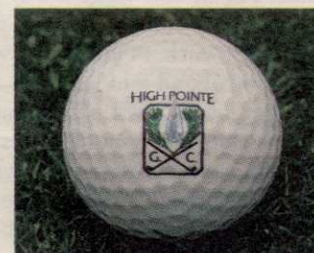
High Pointe Golf Club Williamsburg, MI

A golf course's biggest asset is its grass. Fast greens, luxurious fairways, and thick roughs leave lasting impressions with every golfer.