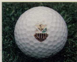
Bethesda Country Club Bethesda, MD