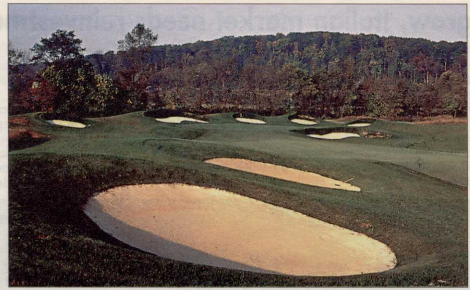
The Scottish-stacked bunker style at Gary Player's Raspberry Falls G&CC in Leesburg, Va.

The countryside's natural features rolling terrain, meandering streams, natural rock outcroppings, and spectacular vistas - were all incorporated into the layout. The most dramatic and formidable feature of Raspberry Falls is its Scottish-style stacked-sod bunkers. Inspired by the great links of the British Isles, their steep-faced walls, constructed with layer upon layer of sod, give the golf course a distinctive look.