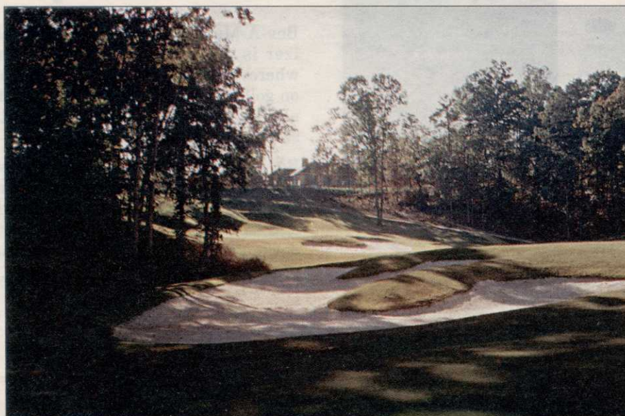
The 18th hole greens complex at Tanasi Country Club in Loudon, Tenn., designed by Ault, Clark & Associates, is an example of the intricacy of SAJO's construction work. The course was finished in November 1995 and opened last summer.