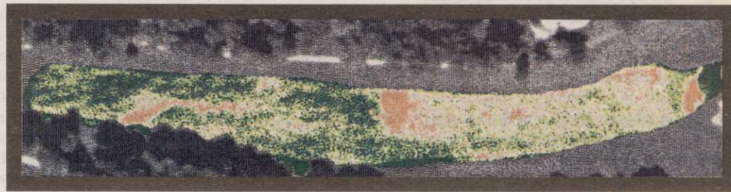
The WHoleView image from a flyover shows turf health, from the less healthy browns and yellows to the more healthy greens and dark greens.