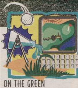
ON THE GREEN

When the top dressing is wet, for whatever reason, this drag-mat concept can also work quite well when top dressing greens with straight sand, or with a 90/10, 85/15, 80/20 sand/peat moss mixture.