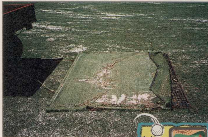
The mat: a 1-inch-square metal drag covered with a piece of artificial turf-type material.