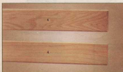
Choose from premium, straight grain oak or fir seat boards; impeccably finished and pre-drilled for easy assembly.