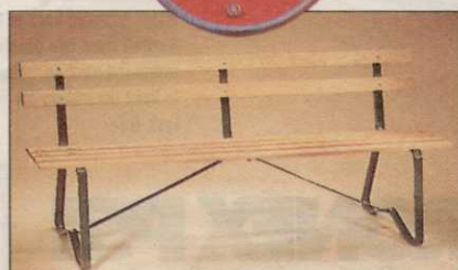
Elegant to look at. A luxury to sit upon. And best of all...very easy on your budget! Benefits only a Par Aide bench can offer.