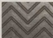
Patented chevron belt design

To demo our newest model call 612-785-1000.