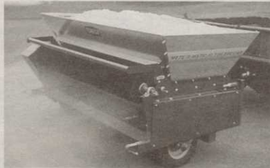
Spread heavy or as light as a feather.

Top dress as light as a feather or as heavy as a thick blanket using the same Turfco spreader. It's the first top dresser in the industry to give you such a wide range in capability — from a light top dressing for frequent applications all the way up to heavy top dressing for applications after aeration. Unlike any other unit, Turfco's patented chevron belt applies dry or wet material equally well. It's the only top dresser that can and it still comes with a 3 year warranty. High performance spreaders since 1961.