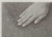
Light top dressing easily brushed in