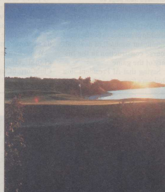
Bay Harbor Golf Club took shape on a 5-mile stretch of Lake Michigan.

Seven holes play along the water, some on bluffs 170 feet above Little Traverse