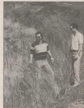
Wetlands at Hammock Dunes in Palm Coast, Fla.