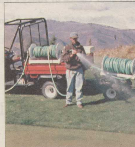
Three types of hose reels used at Country Club of the Rockies: mounted to an E-Z-GO (left); mounted to a Kawasaki Mule (center, in use); and mounted to a fabricated trailer.