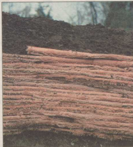
No, this is not sod, which needs repair every couple of years. It's shag rug.