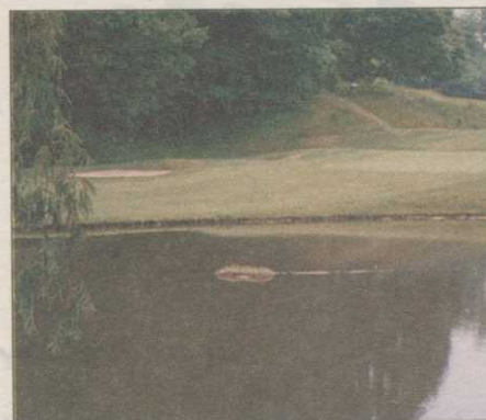
A bale of barley straw floats atop a one-acre pond at Toronto's Board of Trade Country Club.