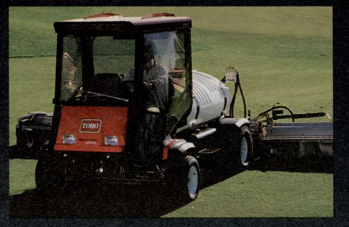
Toro Multi Pro 5500 with new air-conditioned cab.

UNTIL NOW. The world's best sprayer just became the coolest. The Toro Multi Pro® 5500 now comes with an optional air-conditioned cab and a charcoal filtering system that allows cleaner, cooler air to circulate throughout the cab. So spraying even in the worst heat and humidity is a breeze. You can even add the cab to a Multi Pro® 5500 you already have. For more information see your local Toro Distributor, or visit our website at www.toro.com.