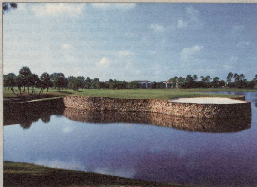
The signature No. 12 island hole at the Country Club at Heathrow (Fla.), a RDC facility.