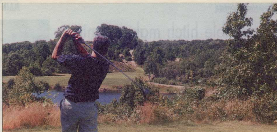
A golfer tees off over a pond 80 feet below on the par-4 17th hole, which exemplifies the ecological character of Widow's Walk Golf Course.

"We in Scituate are thrilled," said Norton.