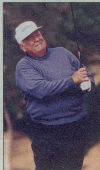
The legendary Billy Casper