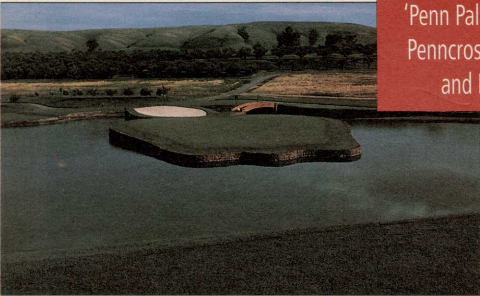
PennTrio No. 17, Apple Tree GC, Yakima, WA