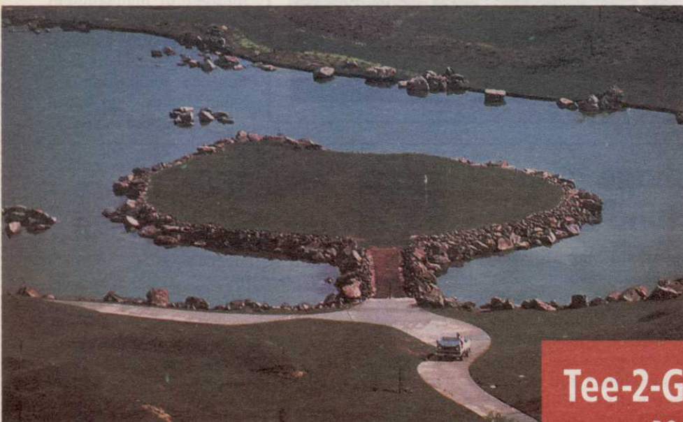
Penncross, No. 17, PGA WEST TPC Stadium Course, La Quinta, CA

So, even when a player's short irons are erratic, and his putting's unpredictable, he can always count on the quality and consistency of 'Penn Pals' greens as he tours the islands.