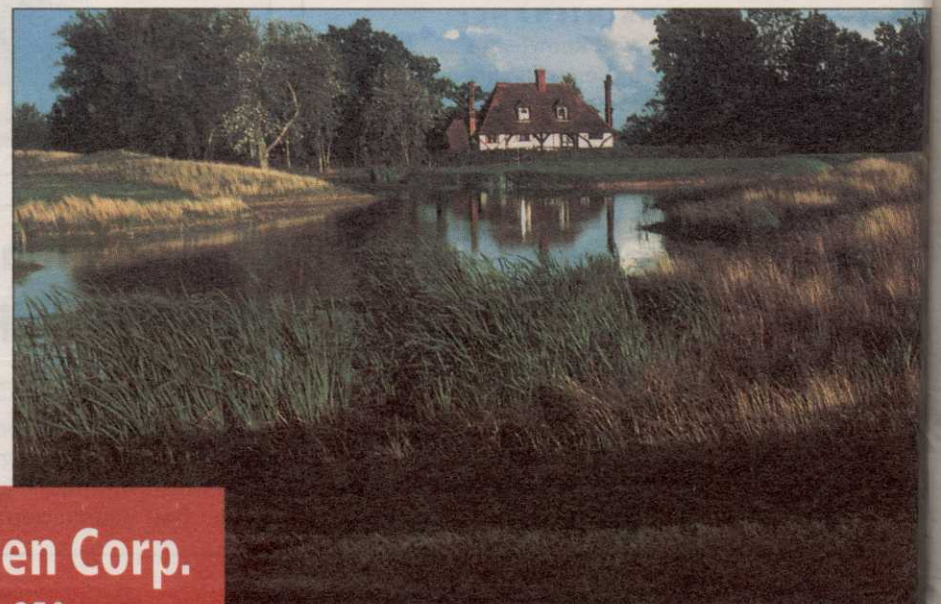
PennLinks No. 17, Chart Hills GC Biddenden, Kent, England