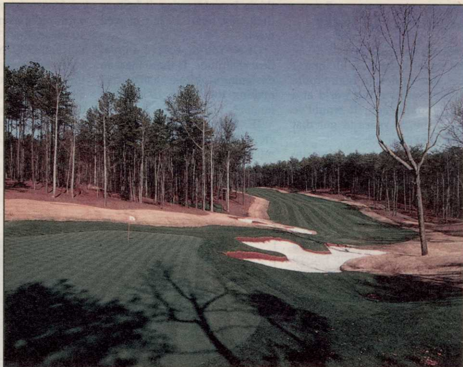
The new Greg Norman-designed TPC at Sugarloaf boasts a mix of terrain and trees.

TPC at Sugarloaf provided the opportunity to try Greg Norman Turf's new