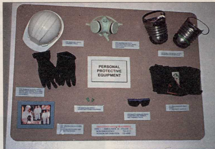
Personal Protective Equipment (PPE) shows an employee by example at TPC at The Canyons in Las Vegas.