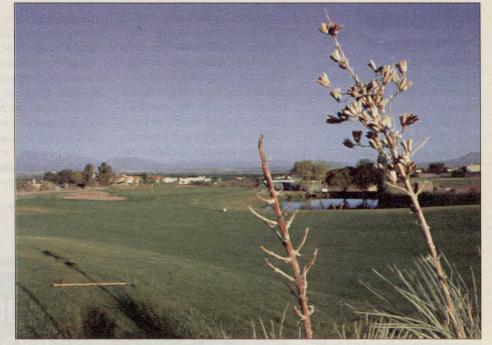
The third hole at Picacho Hills Country Club, a Fore Star Golf property in Las Cruces, N.M.

'When we first took over here, we asked the customers what we could do to improve. They wanted us to do a better job handling the golf carts, put starters at both courses, and start a marshaling program. We did those things and the course