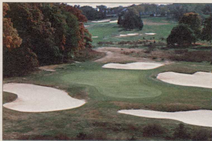
The Black Course at Bethpage State Park, another A.W. Tillinghast design.