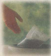
Water-soluble packets reduce applicator exposure.

Naturally, to ensure the maximum effectiveness of your disease control program, we recommend that you apply the appropriate cultural practices for your particular region and course layout. Wherever you're located, you'll find that with no turf restrictions, BAYLETON is right at home. BAYLETON comes in a water-soluble packet for easy mixing and reduced applicator exposure.