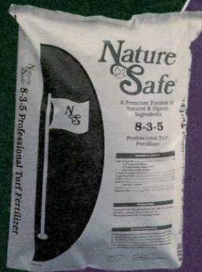
Also available in 10-2-8, 10-3-3, and 7-1-14

FOR A DISTRIBUTOR NEAR YOU CALL (800)252-4727