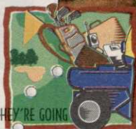
WHERE THEY'RE GOING