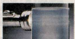
This should shed some light on the subject. Our active ingredient is less than 0.1 micron in size while other sterol inhibitors are about 25 microns in size.

wettable powders, it will never settle out.