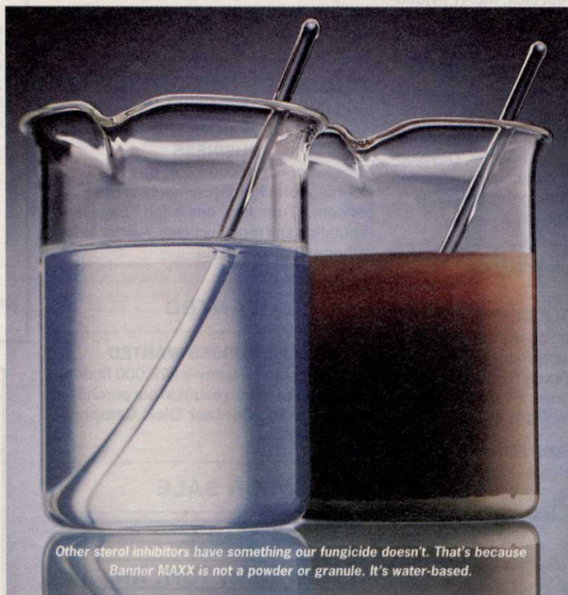
Other sterol inhibitors have something our fungicide doesn't. That's because Banner MAXX is not a powder or granule. It's water-based.

Simply put, Banner MAXX is the best tank-mix partner. It has the same properties as water. It won't clog filters and has no odor. And unlike