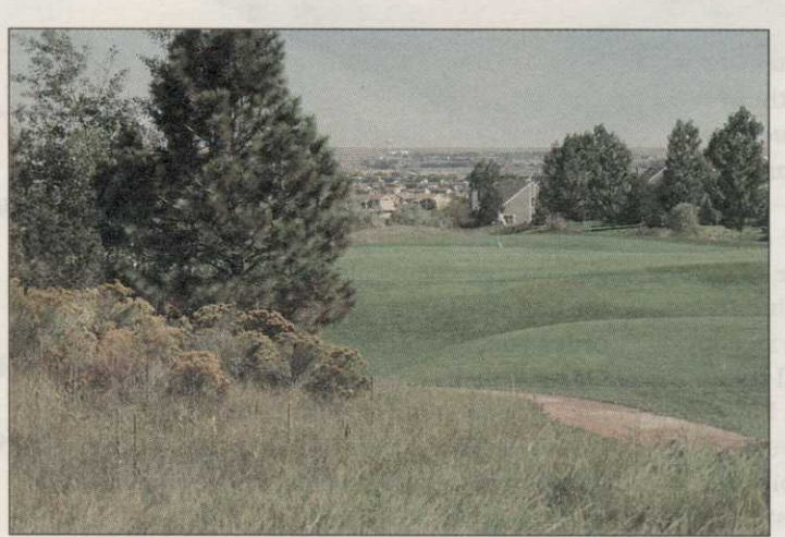
The 16th hole at Stanley Metsker's Country Club of Colorado.