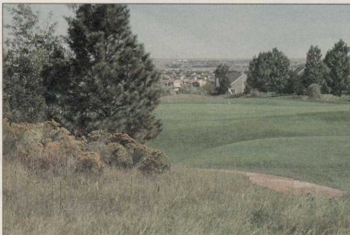
The 16th hole at Stanley Metsker's Country Club of Colorado.