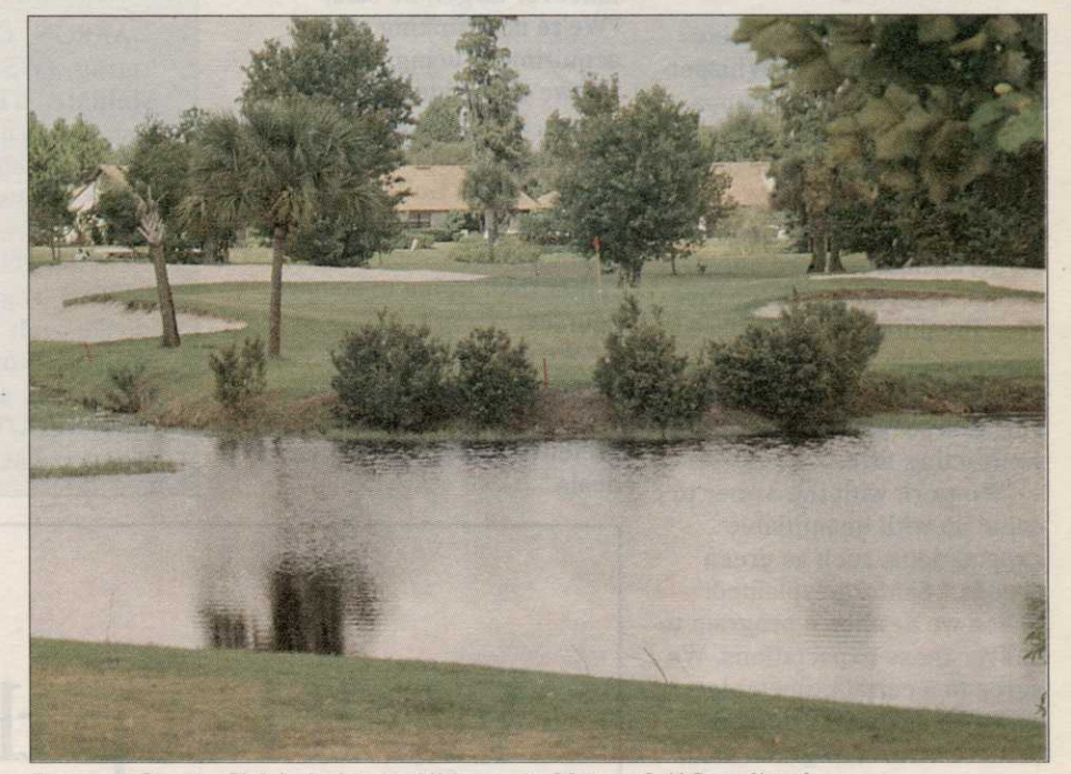
Rosemont Country Club is the latest addition to the Masters Golf Corp. list of courses.