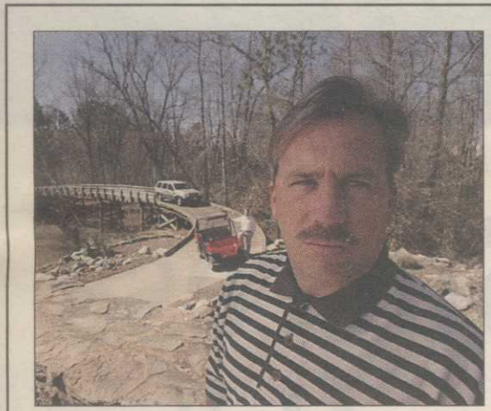
FOCUSED ON EXCELLENCE

Better cooperation between EPA and chemical manu-