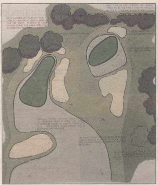
An artist's rendering showing both 10th greens at Riviera; the new one, at right.