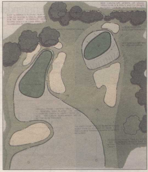
An artist's rendering showing both 10th greens at Riviera; the new one, at right.

Sitting at 315 yards out from the back tee and 301 from the members' Continued on page 36