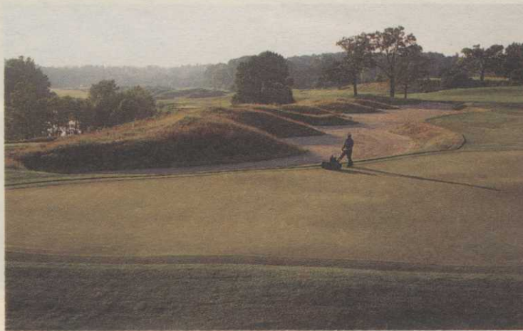
Blackwolf Run in Kohler, Wisconsin, features two 18-hole Pete Dye-designed championship courses.

Beautiful landscaping and attention to detail define both the Blackwolf Run golf courses and nearby 5-diamond-rated American Club hotel—both owned by The Kohler Company.