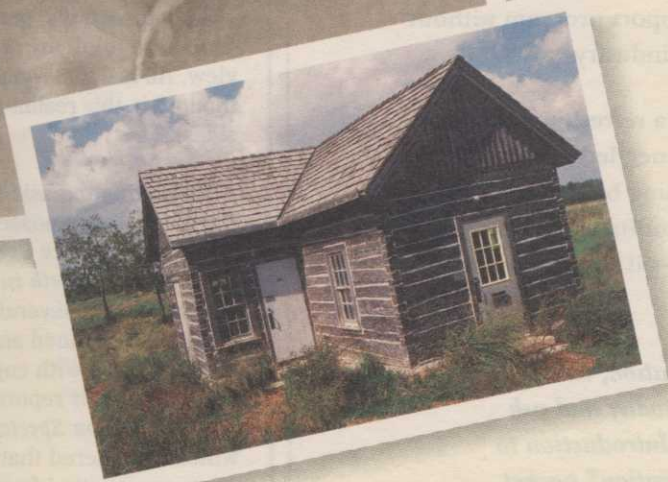
This Norwegian farm building was disassembled, numbered, and shipped to Blackwolf Run to serve as a rest station.