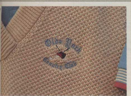
The site's 250-year history as a dairy farm, trading site, and horse stable is reflected in Olde York's historic logo.