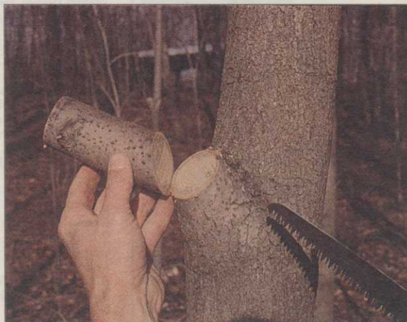
Place pruning cuts outside the branch collar, the swollen area where the branch attaches to the main trunk.

Although maintenance pruning of most shade trees can be done year-round, intensive pruning should be performed in the dormant season. Late winter to early spring, just before new growth begins, is a good time to prune trees. Proper pruning cuts made in the