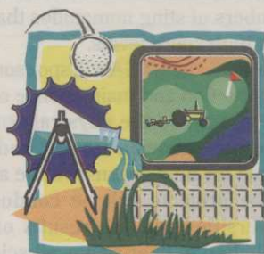
ON THE GREEN

After completing the job and informing me they were perfect, I came up with the idea to check them with a bubble level. Using the level, we found not one head was perfect but