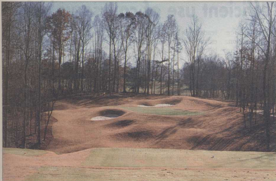
The Golf Club at Bradshaw Farm, built by Landscapes Unlimited Inc. and designed by Grant Wencel, opened in December in North Atlanta, Ga. It is set on an old farm property, with two restored silos framing the 18th green and 30-mile views of the North Georgia mountains.