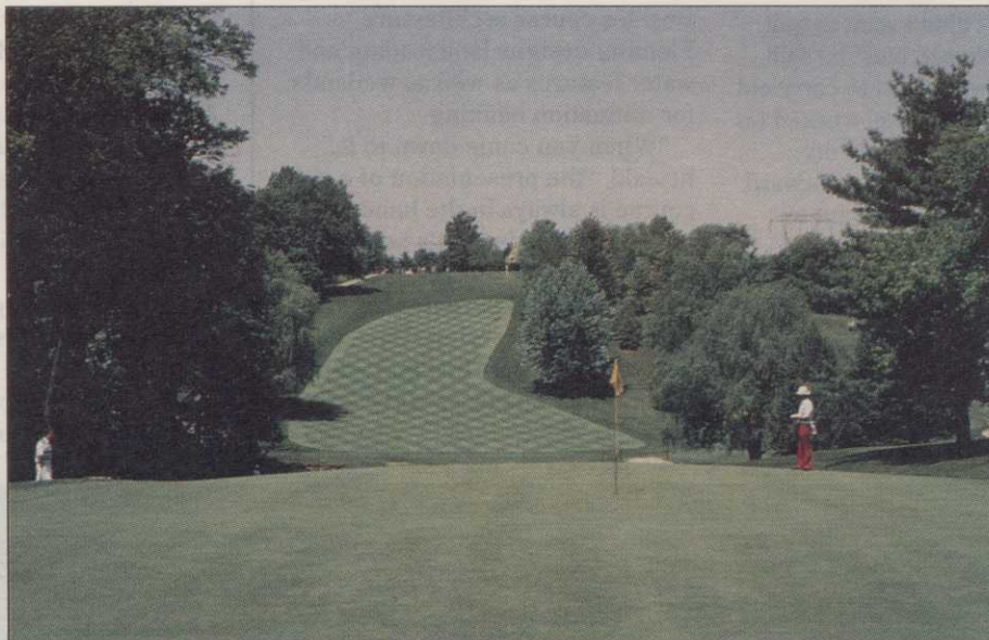
Chester Valley's fairways show the grounds crew's meticulous care.

This year, Chester Valley — site of the Bell Atlantic Classic — was named the best-kept track on the senior circuit, as determined by the competitors themselves. Chester Valley barely outpolled Desert Mountain, site of The Tradition, which earned the honor in 1991.