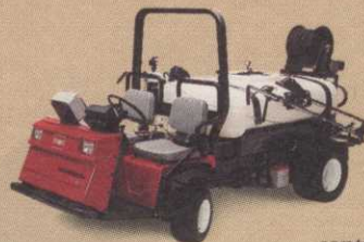
The Workman Turf Spray System combines 200 gallon tank capacity with the mobility of Toro's versatile work vehicle.