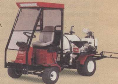
The Multi Pro 1100 is an agile performer with its 45 inch turning radius plus four wheel stability.