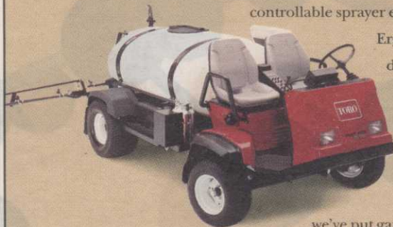
The Multi Pro 5500 features a new drive mechanism for improved climbability and constant speed on varying terrain.