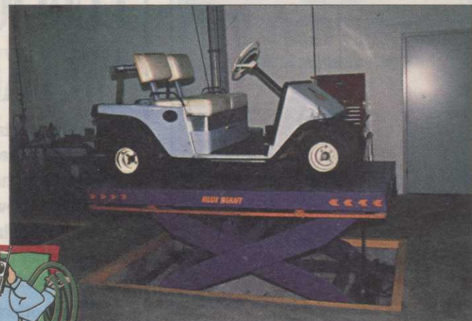
DuPont Country Club's table lift greatly improves safety and working conditions.

• Individual offices — of "sufficient size to be private" — for Shafer, his three golf course superintendents, a landscape