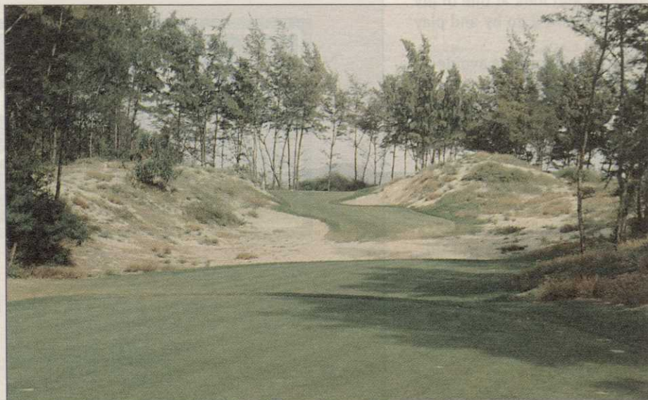
The elegant 9th hole at the Nick Faldo-designed Ocean Dunes in Phan Thiet, Vietnam.

OSAKA, Japan — Stressing an "environmentally sound approach," Greg Norman Golf Course Design has completed the 18-hole Himeji Shirasagi course here.