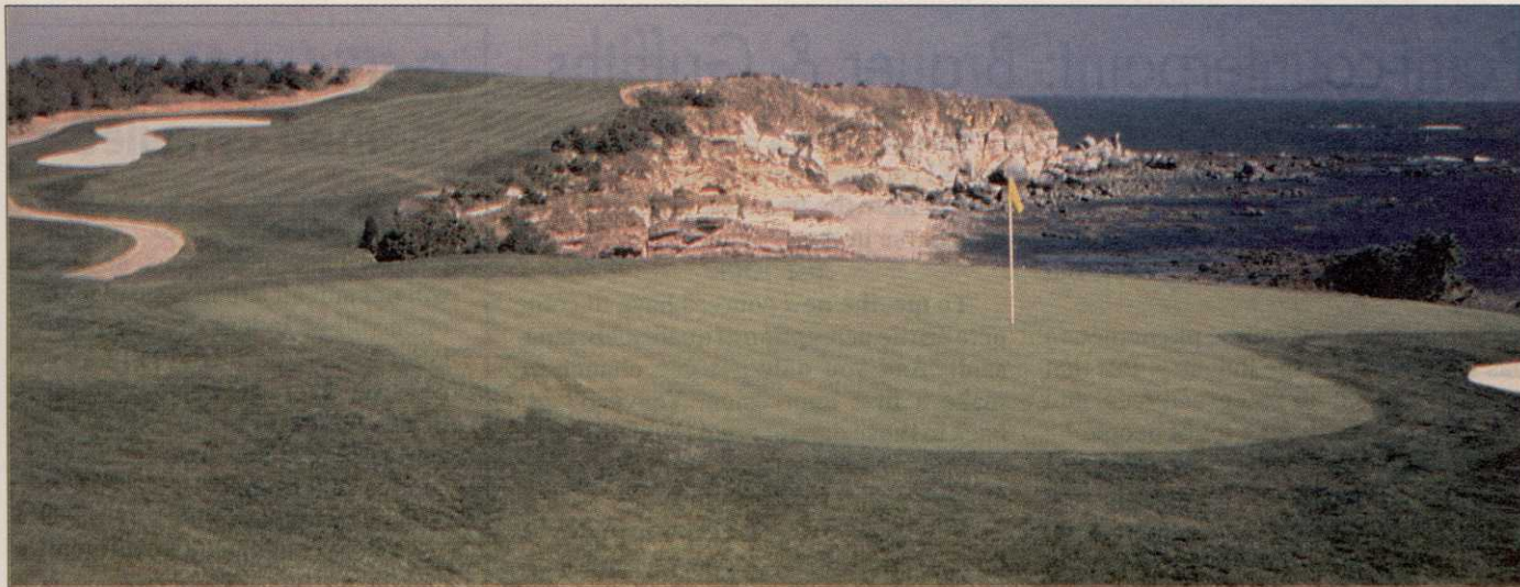
The 13th green and sweeping 14th fairway behind it exhibit the dramatic qualities at Golden Pebble Beach, an 18-hole track in Dalian, China, designed by Peter L.H. Thompson of San Rafael, Calif.