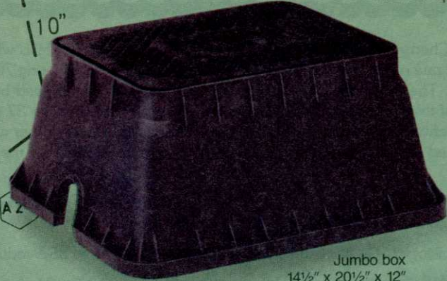
Jumbo box 14 1 / 2 " x 20 1 / 2 " x 12" to 18" deep