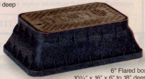
6" Flared box 10 3 / 4 " x 16" x 6" to 18" deep