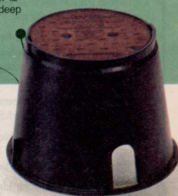
10" Round box 9" diameter x 10" deep