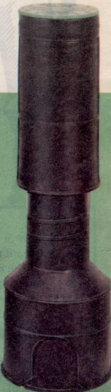
Polyiron box 7 5 / 16 " diameter x 29 1 / 2 " to 64 1 / 2 " deep