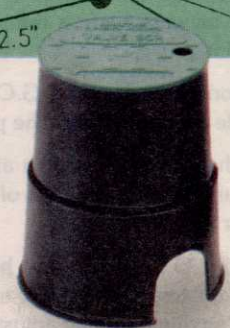
Economy box 6 3 / 8 " diameter x 9" deep