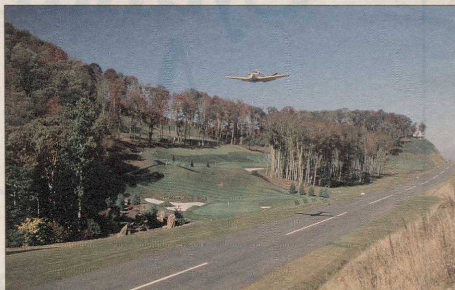
An airplane flies over Mountain Air Golf Course as it comes in for a landing on the highest airstrip east of the Mississippi River.