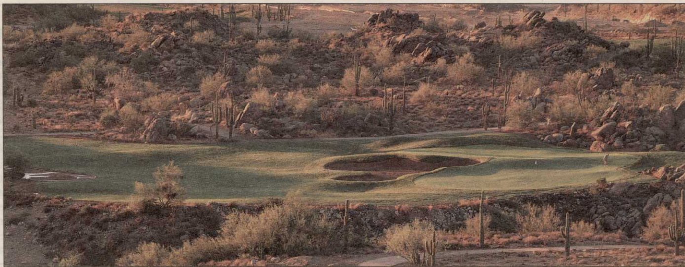
The 17th green complex indicates the character of the new Keith Foster-designed SunRidge Canyon Golf Club.